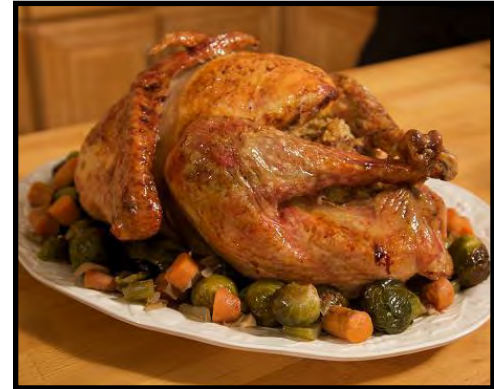
Recipe compliments of "Cooking With Nonna," TV Show 2010